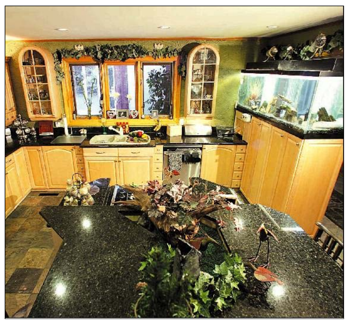
The grand foyer, top, of this Claremont home formerly owned by Toronto Maple Leaf great Bob Baun, features floating oak stairs. The 400-square-foot custom kitchen, above, has granite counters and a built-in 125-gallon aquarium that divides the kitchen from the hallway.